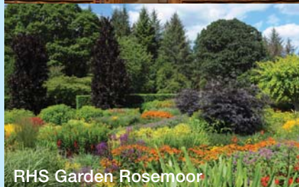
RHS Garden Rosemoor